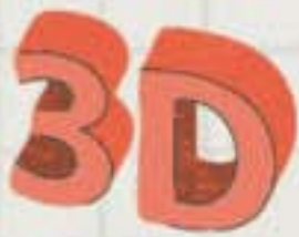
Shape of goods