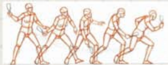
Sequence of motion