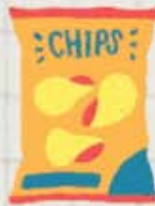
Shape of packaging